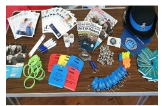
behaviour and speeding concerns.